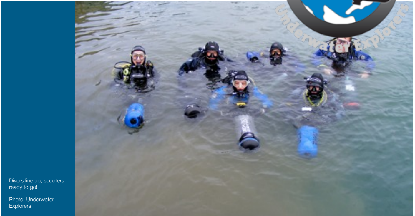
Divers line up, scooters ready to go!