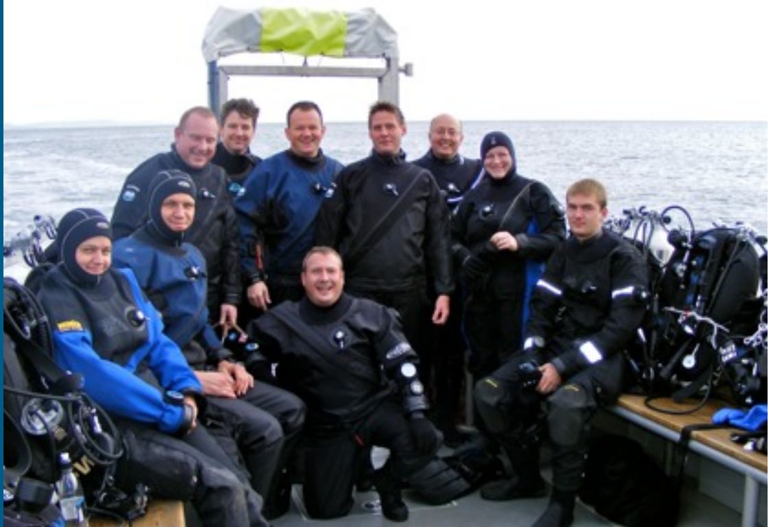
The group has fun on the boat!