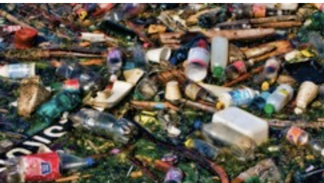
Rubbish pollutes a dive site

GUE members can read Todd's full article in the latest issue of Quest, available for download at www.gue.com .