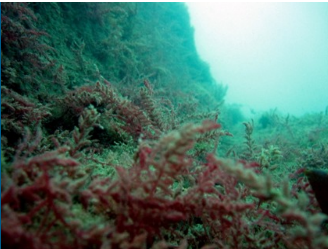
Winning photo in the GUE Experience weekend.